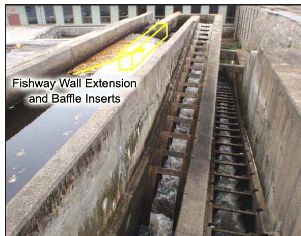
The Palisades Mill Fish Ladder to include an extension and new baffle system. See yellow in photo.

The Nature Conservancy is working closely with RIDEM F&W to schedule these modifications for improving the fish ladders during the fall of 2018.