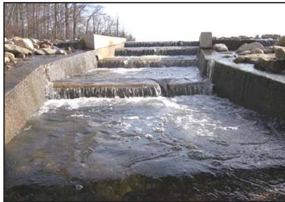
Indian Lake spillway on the Saugatucket River

The project, working closely with RIDEM Division of Fish and Wildlife, is scheduled to make these modifications for