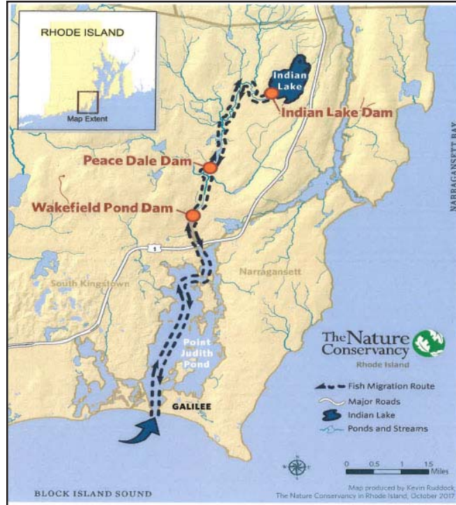
The Saugatucket River runs from Indian Lake to the north to the northern end of Point Judith Pond and empties into Block Island Sound.

Most recent observations and assessments by RIDEM, NOAA and USFWS fish passage engineers have identified several problems, as well as opportunities to improve, fish passage performance at both the Palisades Mill and Indian Lake fish ladders.